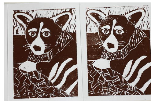
Prints by one of my students