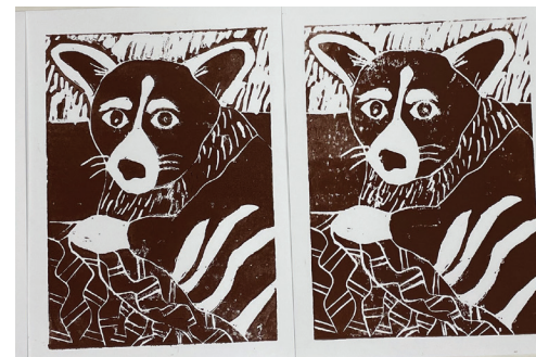
Prints by one of my students